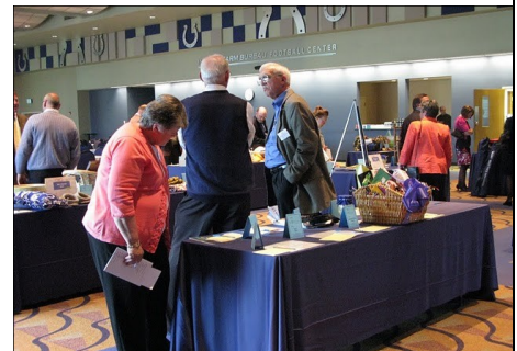
The 2011 benefit auction will be held at the Indiana Farm Bureau Football Center.